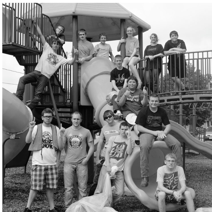
Above: Students pose on the equipment at Central Park after cleaning up Algona.

AHS worked in conjunction with Central Financial Group of Algona in helping this cause.